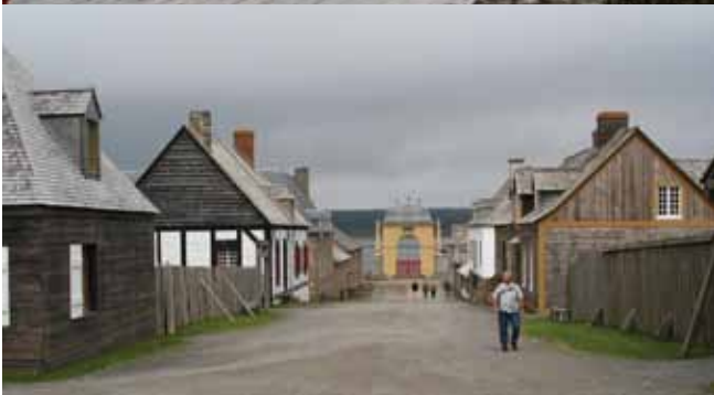
Fortress of Louisbourg

mile from the museum. The fortress is a 1961 reconstruction of one-fourth of the original fortress, as the British destroyed the site when they abandoned it in 1761. Our guide was only interested in telling the military history of the fortress, so we skipped all of the cultural activities to visit the fortress's defensive works and military buildings. We spent four hours with our guide visiting the Dauphin Demi-Bastion, the King's Bastion, Eperon Battery, the Piece de la Grave Battery, Frederic Gate, and Dauphin Gate.