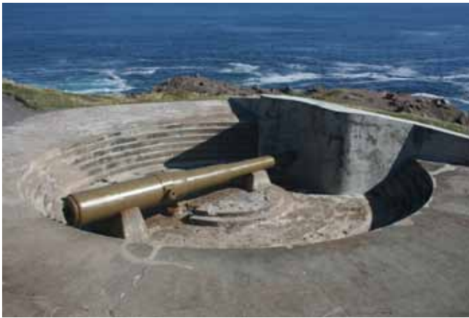
Cape Spear Battery

The third site I visited was McNutt Island, near Shelburne, Nova Scotia, as part of the CDSG special tour to Nova Scotia. A lobster boat transported us to the island on September 22, 2011. During World War II, the U.S. Army supplied the Canadians two 10-inch guns on barbette carriages to provide coast defense for the anchorage at Shelburne as ships assembling here for convoys to Europe. The two barbette guns came from Battery Quarles, Fort Worden, WA. The Canadian Army constructed two concrete emplacements for these guns, but at the end of the war the batteries were abandoned. Several years later, efforts were made to scrap the guns, and one gun was cut into chunks before these efforts were abandoned. Today, the two 10-inch M1888 guns (#12 & #37 Watervliet) on M1892 barbette carriages (#11 & #1 Watertown) remain abandoned within their emplacements. As you can see in the accompanying photographs, one gun with its carriage remains intact (but with most of its small pieces removed), while the other gun and carriage are in pieces (and several of those pieces are missing). Ownership of the site is not clear, but mostly likely it is owned by the provincial government.