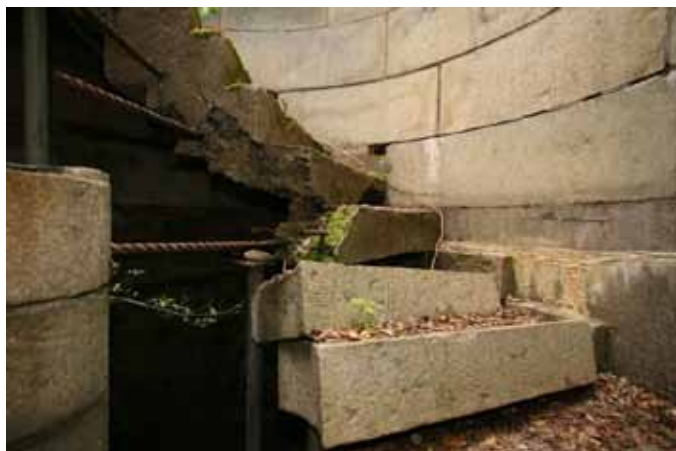
North staircase before

to the staircase. At my request, the Fort Adams Trust obtained an estimate from a local engineering/construction company already doing stabilization and restoration work at the main fort.