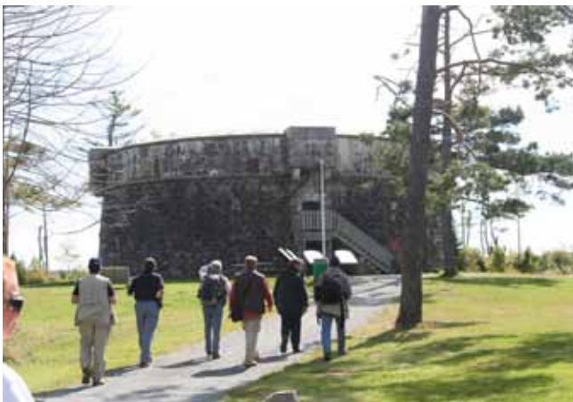
Prince of Wales Tower

Upon our return to the mainland at noon, we traveled to city-owned Point Pleasant Park, home of the Prince of Wales Martello Tower, Cambridge Battery, Northwest Arm Battery, Chain Rock Battery, Fort Ogilvie, and Point Pleasant Battery. Prince of Wales Martello Tower, built in 1792 and is 26 feet high and 72 feet in diameter, was in remarkable good condition. In 1813, the tower's upper level mounted two 24-pounder guns on traversing platforms, with four 6-pounder guns on the barrack floor. The tower has been recently closed to the public due to budget cuts, however, our three Parks Canada guides opened it for us to explore. We were able to explore all three floors, but it was quite evident that mildew was attacking the lower level due to lack of daily ventilation.