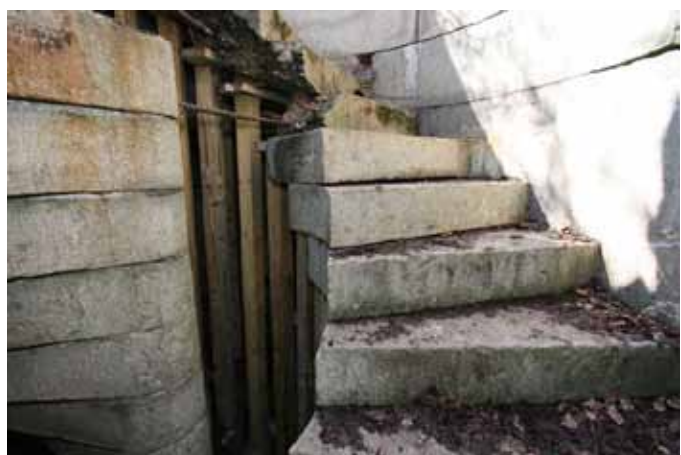
North staircase after