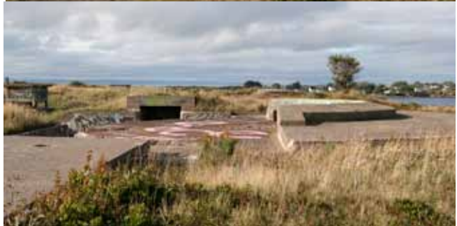
Chapel Point Battery