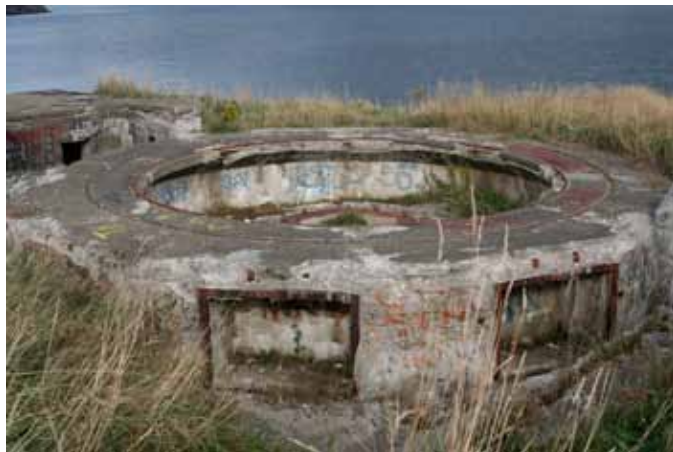
Stubbett's Point Battery

After Fort Petrie we drove to the east side of the harbor to visit Stubbett's Point Battery, Chapel Point Battery, and Oxford Battery. Stubbett's Point Battery lies adjacent to the highway on a high cliff. In service from 1939 to 1946, the battery contained a twin 6-pounder gun and three searchlight positions. The battery anchored the anti-submarine net that stretched from South Bar to Daly Point. The site is now a refuse pit and graffiti heaven. The concrete is in very poor condition and appears to be in danger of collapsing onto the beach below.