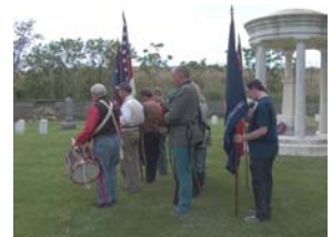
Small ceremonies were conducted to honor all the veterans resting in Finns Point National Cemetery.