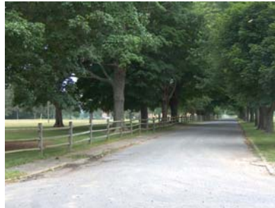
Now: How Cemetery Road looking west looks today. The houses of Officer's Row were moved to Delaware in 1934.