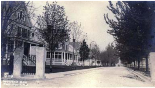
Then: Looking west at the Main Gate of Fort Mott and Officer's Row