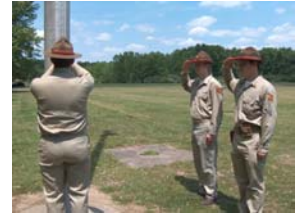
Fort Mott staff raised the park's flag to full staff at noon.