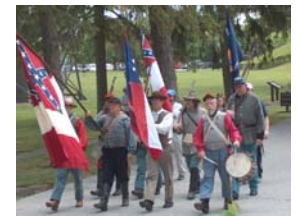
Civil War Re-enactors and Living History personnel marched from Fort Mott to Finns Point National Cemetery