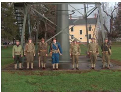
The Officers and Enlisted men of Battery E, 7th Coast Artillery.