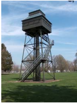
Eastern Fire Control Tower.